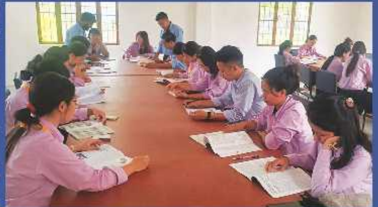
Students in the college library