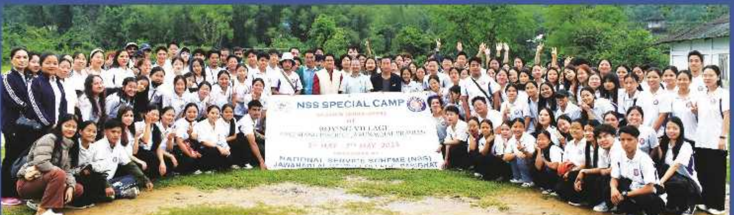
NSS Special Camp at Boying village May 2024